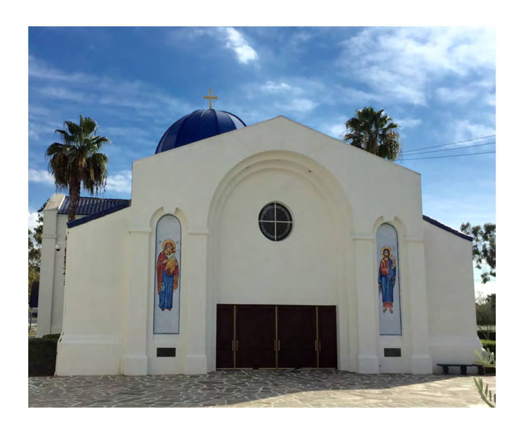
FALL EDITION (SEPTEMBER, OCTOBER, NOVEMBER, DECEMBER) 2019

Assumption Of the Blessed Virgin Mary Greek Orthodox Church Long Beach, CA